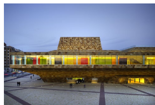
La Llotja Theatre and Conference Centre, Lleida, Spain