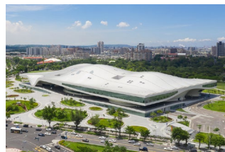
National Kaohsiung Centre for the Arts, Taiwan