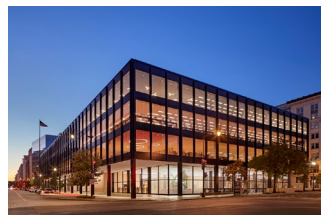
Martin Luther King Jr. Memorial Library, Washington D.C., US