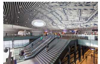
Municipal Offices and Train Station, Delft, NL