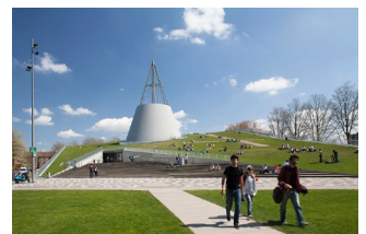
Delft University of Technology Library, NL