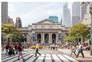
New York Public Library, US